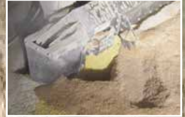
Carries As Much Grain As The Job Requires.

Note: These values can fluctuate greatly depending on the varying conditions present, including but not limited to; moisture content, grain commodity type and flowability, amount of foreign matter present, and compaction rate. These all play a part in the performance of the paddle sweep. Paddle sweep capacity may also vary as the angle of the sloping grain varies. For optimal performance, dry flowable grain is recommended. The paddle sweep is not intended for use in high moisture grain storage applications or suitable for non-grain commodities including fertilizer, lime, etc. Also, grain that may have gone out of condition due to moisture or insect activity and has become hard or caked will result in diminished capacity.