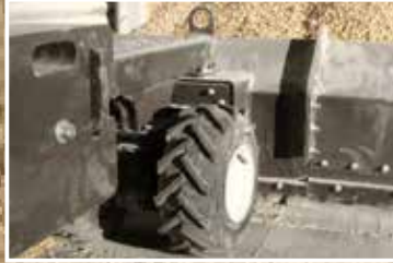
Tires Are Foam Filled, With Tractor Tread.