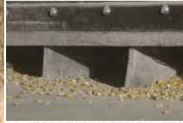
Flexible Rubber Paddles Move Grain Gently To Sump.