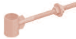
HINGHD: 1" hinge bolt