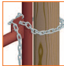
Posi-lock chain latch