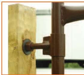
General duty hinge

Length refers to size of opening. The length of the gate is actually 5 1/2" shorter. i.e.: 10' gate is actually 9' 6 1/2"