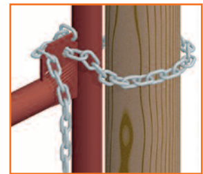
Posi-Lock chain latch