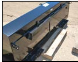
Standard Koyker Fast Attach (FA)