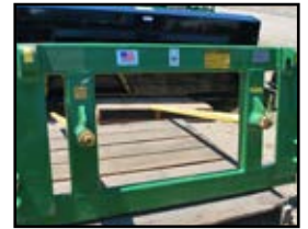
John Deere 500 Series