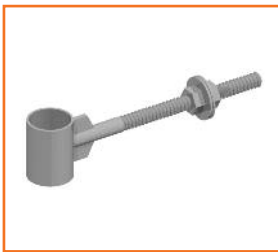
Heavy duty hinge

Length refers to size of opening. The length of the gate is actually 5 1/2" shorter. i.e.: 10' gate is actually 9' 6 1/2"