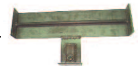
Lock Plate Assembly Part #: H205962