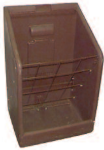
Tilt-Out Feeder Tank Part#: H205958