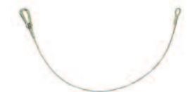
Galvanized Wire Rope Part #: H205714