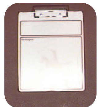
HiQual Clipboard Part #: H206641