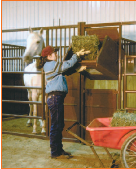
Tilt Out Feeder