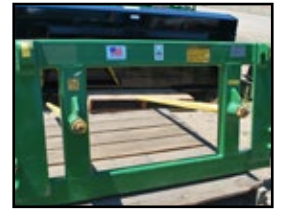
John Deere 500 Series