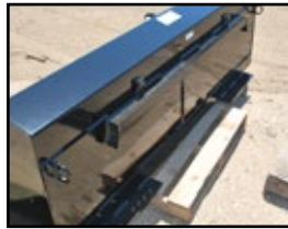
Standard Koyker Fast Attach (FA)