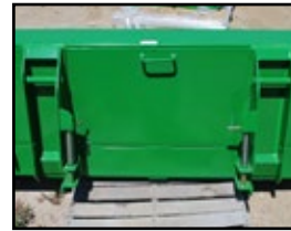
John Deere 600/700 Series