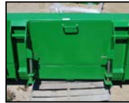
John Deere 600/700 Series