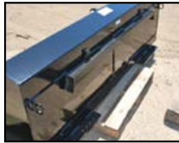
Standard Koyker Fast Attach (FA)