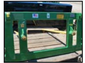
John Deere 500 Series