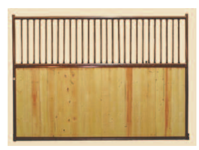
Vertical Rail Divider