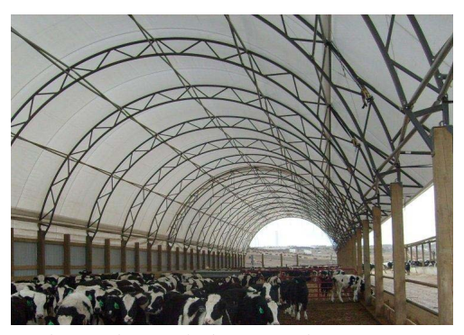
Shown with optional side curtain and awning option.