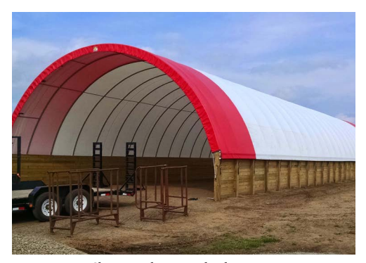
Shown with optional color cover.