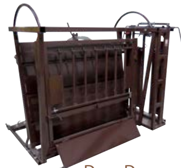
Drop Down Kick Pan