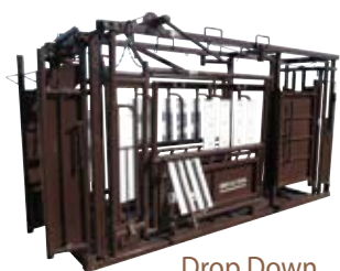
Drop Down Side Pipe