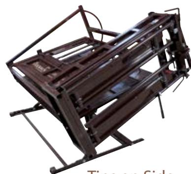
Tips on Side