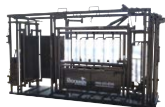
Preg Test Gate